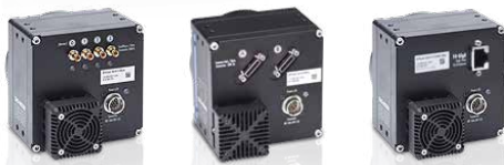
HSR CoaXPress HSR Camera Link HSR 10GigE

Very high resolution with large pixels: The SHR shines when maximum resolution and top image quality are required for your task.