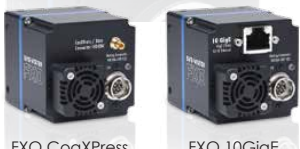
FXO CoaXPress FXO 10GigE

The FXO series combines the outstanding image quality of the Sony Pregius S sensor with the most modern high-speed interfaces.