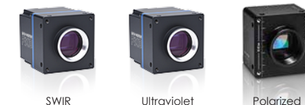
SWIR Ultraviolet Polarized