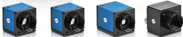
ECO Standard ECO 410 ECO PoE ECO IP67 >>BlackLine<<

An ECO fits into any type of application. The ECO series impresses with its minimal footprint. And that even without compromising on performance.