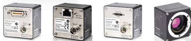
EXO Camera Link EXO GigE EXO USB3 EXO Tracer

The EXO series is designed to create an Industrial camera allowing easy and scalable integration, providing rich functionality with minimal design-in effort.